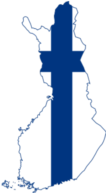
"Me and neighbours"